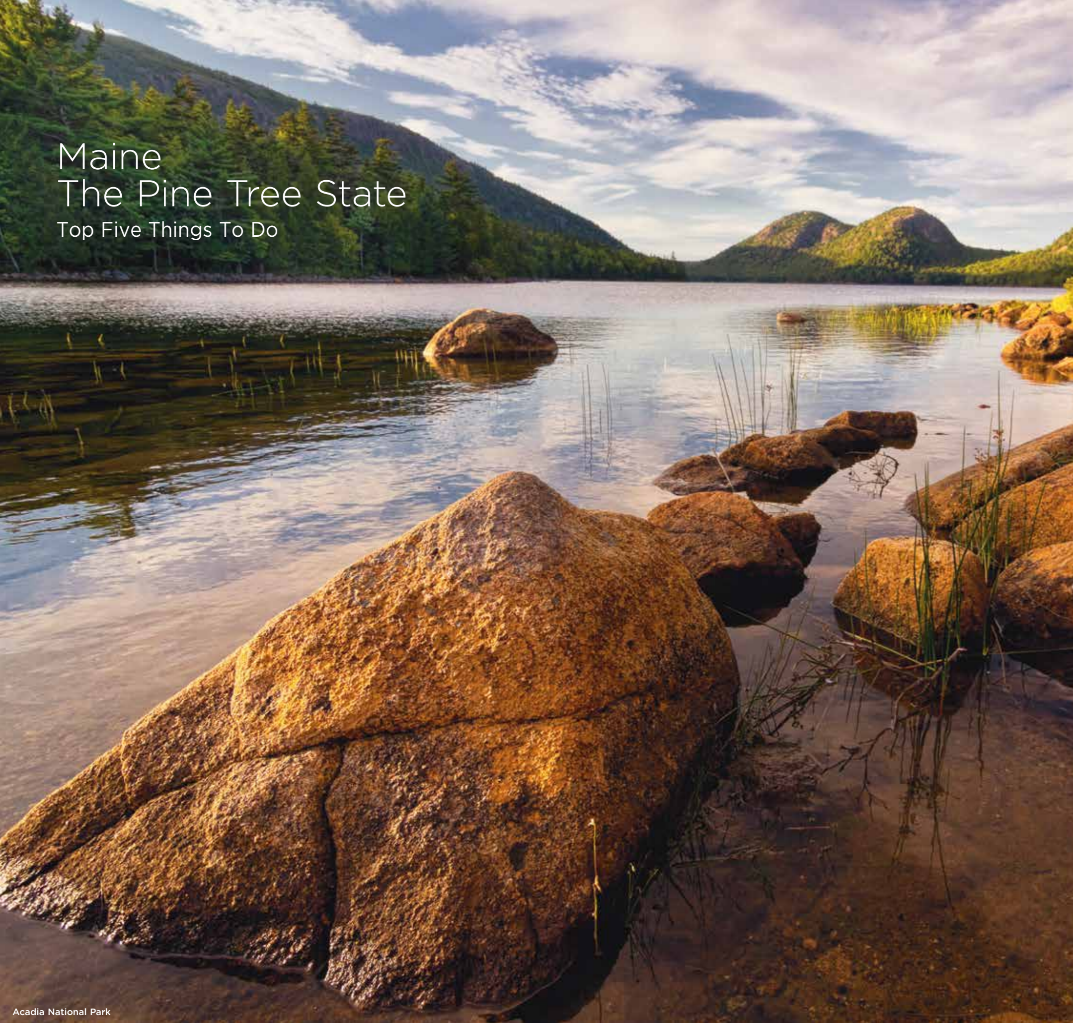
Acadia National Park

1 Visit Acadia National Park: Acadia National Park comprises an impressive 47,000 acres of land on Maine's Mount Desert Island, Isle au Haut and the Schoodic Peninsula. The park is most known for its undeniable beauty with a unique landscape that includes mountains, lakes and the rugged Downeast coastline. Home to a variety of wildlife and recreational activities from hiking to rock climbing, the park boasts some of the greatest views and activities in the state. Visitors can't miss Cadillac Mountain... the first place along the east coast you can witness the sun rise.